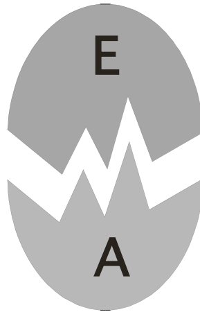
Fig 1. Affordances emerge in the interaction between environment (E) and agent (A).

How does the situation change when we replace the primitive agent by a cognitive agent – specifically by a human being or a cognitive robot? The physical affordances of the environment will still determine to a large extent where the agent will move (see Fig. 1): one of the fundamental aspects of affordance, of course, is gravity; it will keep the agent on the ground, for the most part. Other aspects are passages that are easy to traverse and obstacles that will prevent the agent from moving to certain places. Besides the affordances imposed by the environment certain affordances are imposed by size, shape, and abilities of the agent: the agent can perform certain movements on the basis of its anatomy and physiology; certain other movements are not possible. In general, affordances are determined by the interaction between agents and their environments: for instance, the size of an agent interacts with the size of a passage: the relationship between these sizes will determine the affordance of certain movements between the agent and the environment.