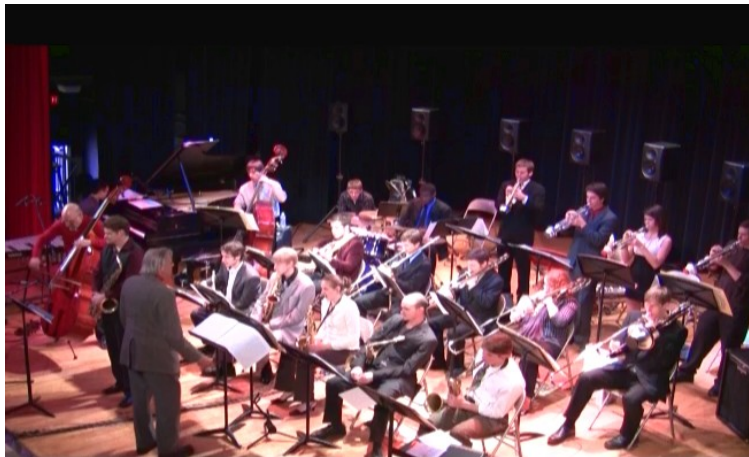
■ Figure 3 An HCMP performance. The live jazz ensemble is complemented by a 20-piece virtual string orchestra played over an array of loudspeakers visible behind the band.

synchronize with the live band. Then, the per-track stretch factor is adjusted slightly for each track to drive the track’s audio file position toward the global mean.