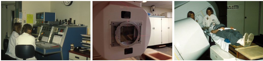
■ Figure 1 The CNTS console, collimator, and patient setup in gantry.

and capable of producing counterexamples. It must also support a rich logic for partial formalization of critical aspects of the system – not all parts of a design need to be subjected to formal analysis, and those that do not should be easy to abstract. Alloy makes it easy both to model and check designs, and it has a long history of discovering flaws in designs of safety- and correctness-critical systems (e.g., [10, 34, 25, 40]).